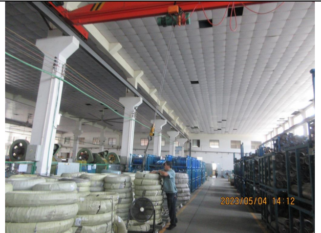
NC-one worker using the crane did not wear hard hat during operation