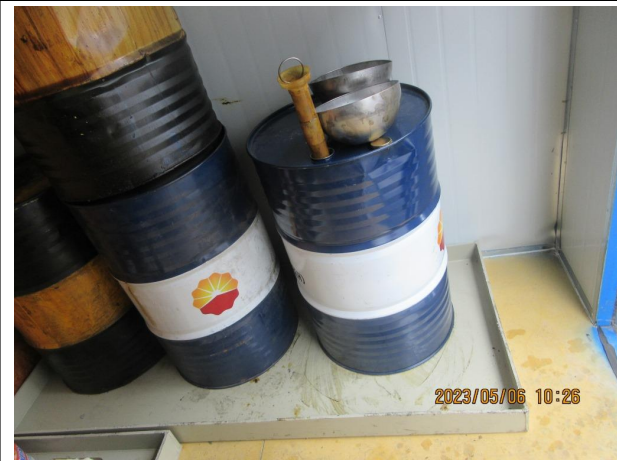
Chemical with secondary containment