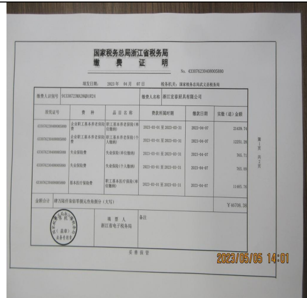
NC- The factory did not provide social insurance to some workers