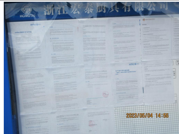
Amfori BSCI code posted in the factory