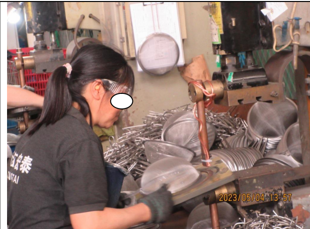
NC-spot welding worker did not wear dust proof mask during operation