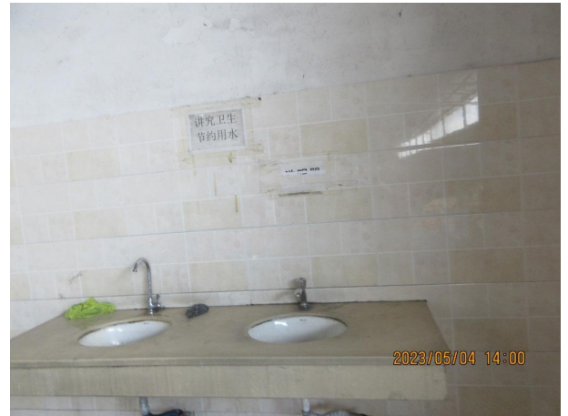
NC-No hand sanitizer or soap was provided in hand washing sink