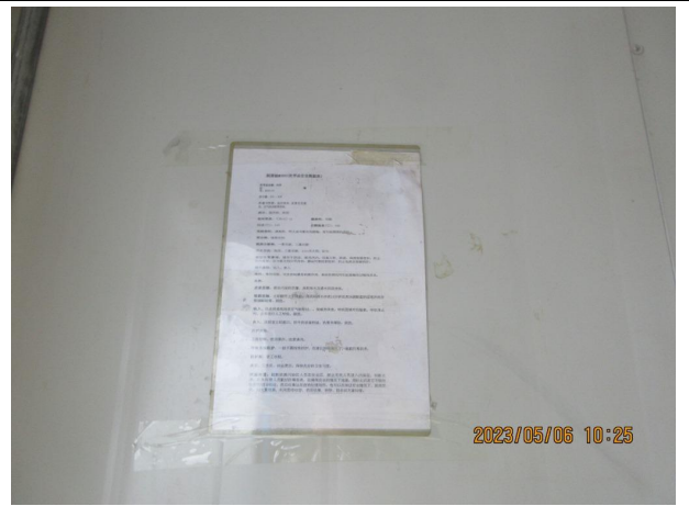
MSDS of chemical