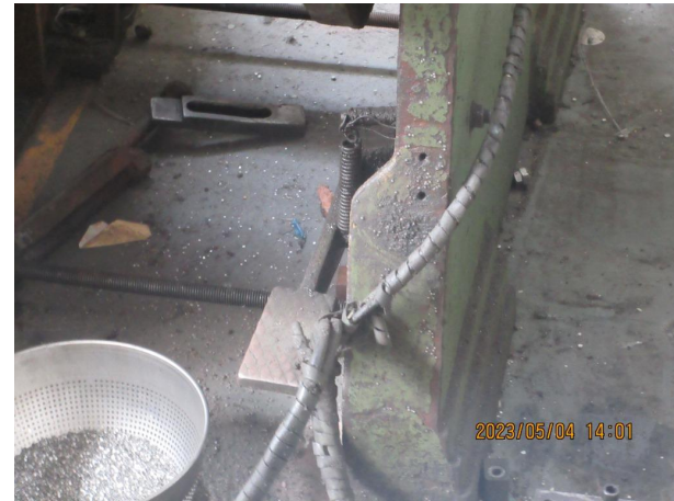
NC-punching machine was not installed with pedal cover to prevent unexpected touching of feet control

Report No.: JSASCN23625640 Audit Date: May.04-06, 2023 Page 8 of 8