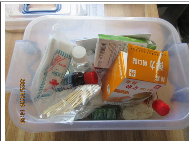
First aid kits