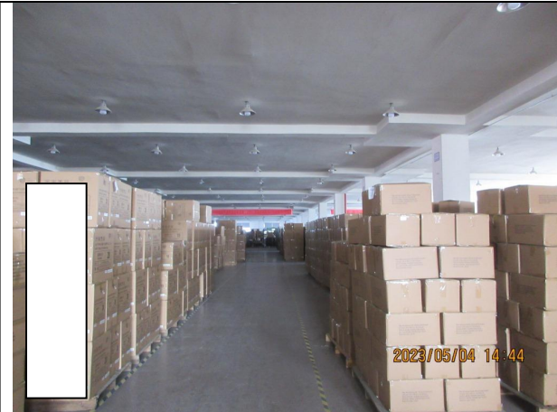
Finished goods warehouse