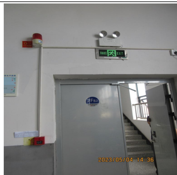
EXIT sign, fire alarm and emergency lighting