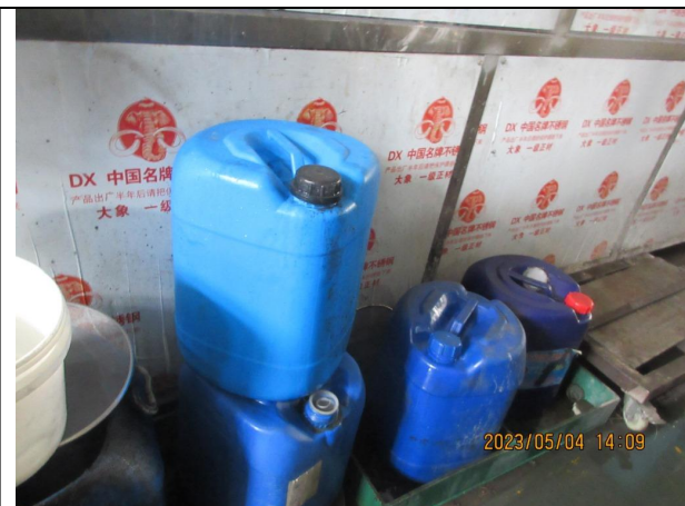
NC-Some chemical containers were not marked with safety label