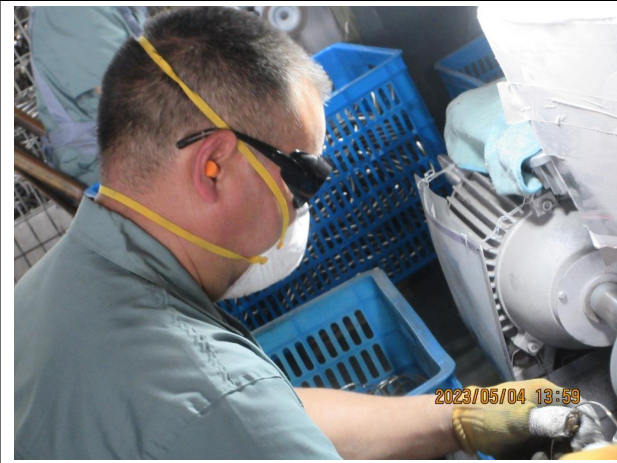
Worker wore PPE during operation