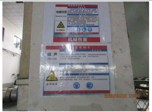
Notification of occupational hazards