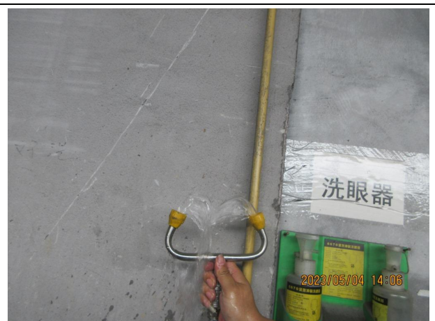
Eye washing facility