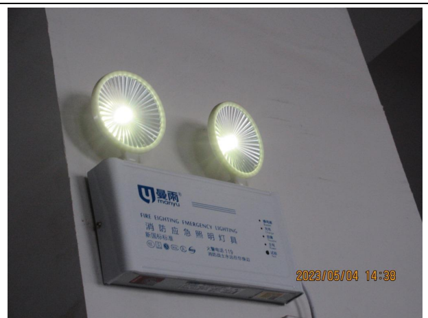
Emergency lighting testing