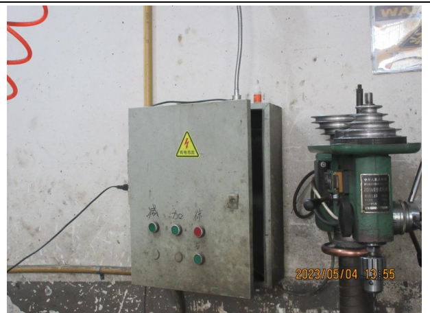
NC-electrical box was not kept closed and locked