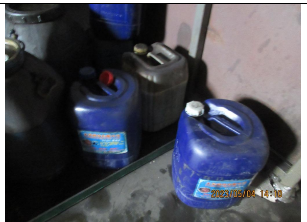
NC-some chemicals were not provided with secondary containment