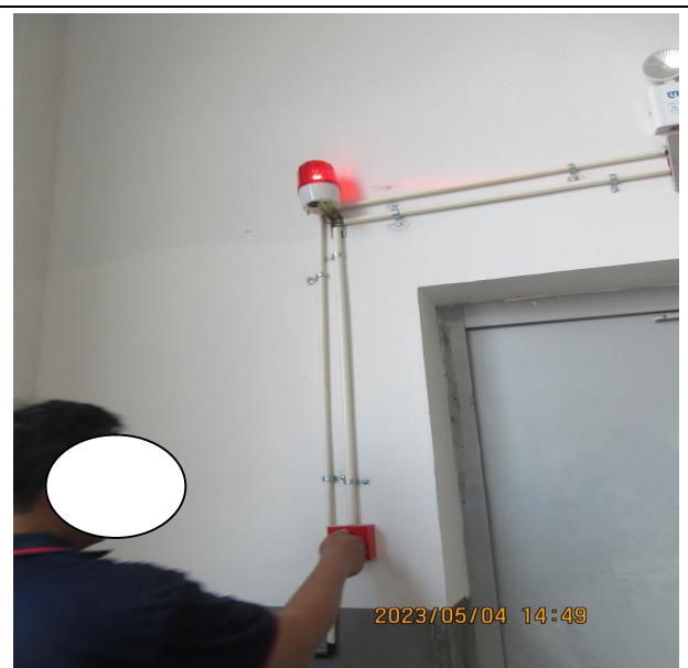
Emergency lighting testing