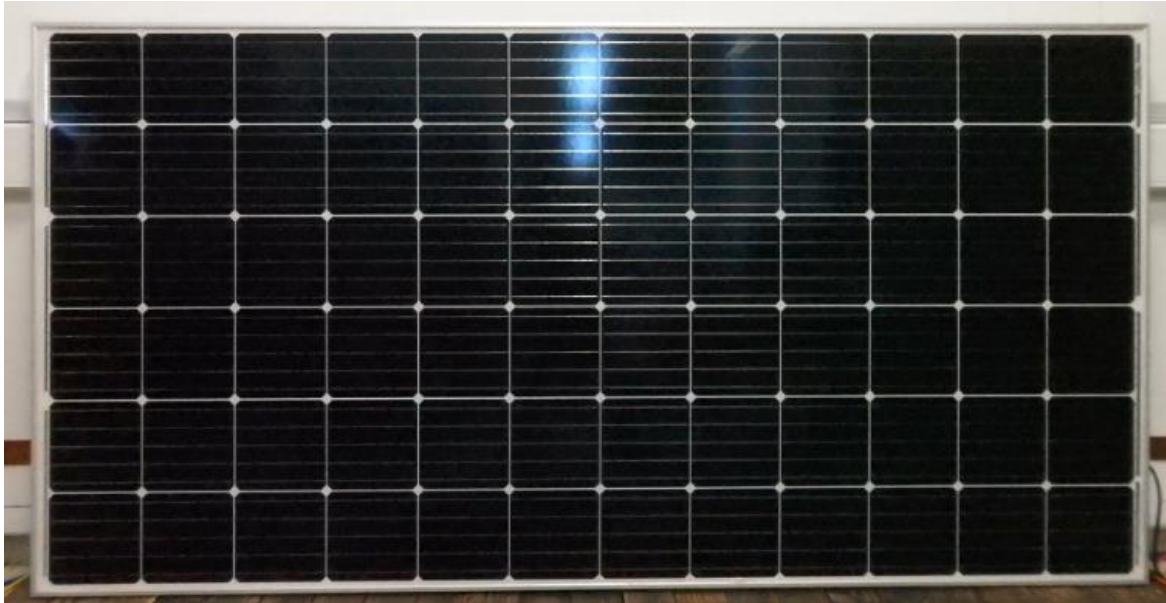
Front view of sample