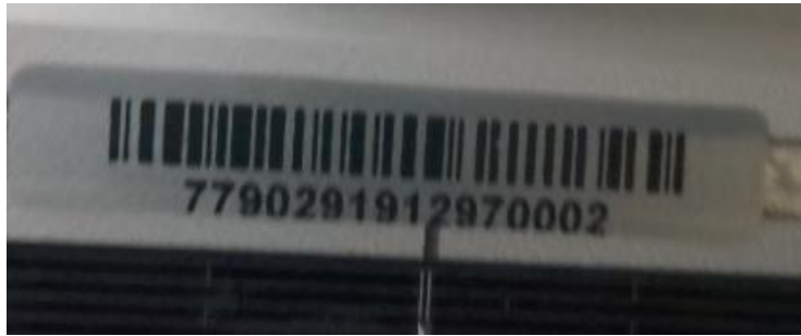
Serial Number of Sample